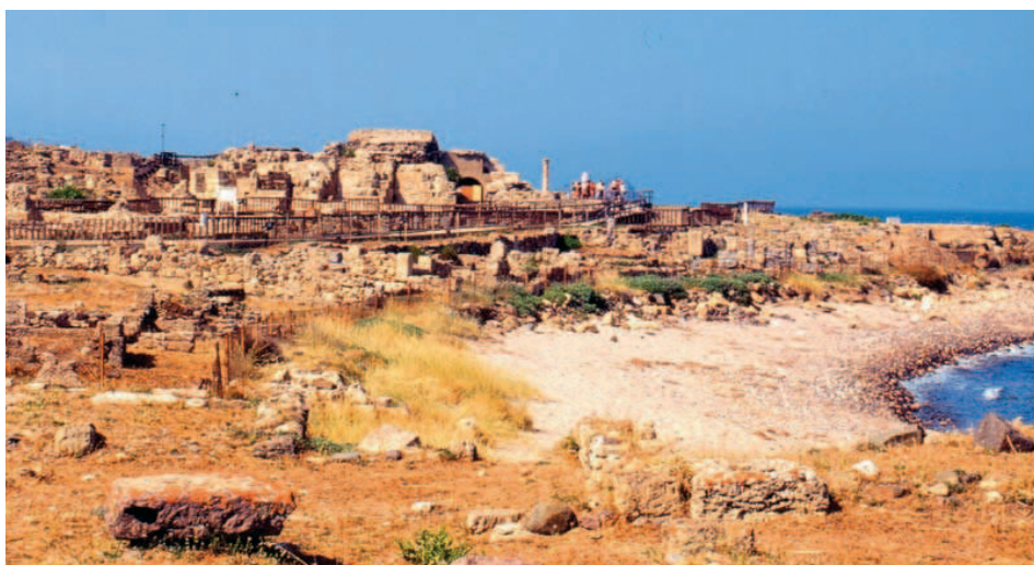
FIGURE 1 The archaeological site of Nora.

formation of not only its own objectives but also, notably, the tools needed to achieve them. Among these—and quite apart from developing specific techniques for the direct and preventive conservation of surfaces—there is now a major emphasis on planning treatments as part of a global project of site management that includes not only the material conservation of the artifacts but also the relationships that exist among research, scholarship, presentation, and the dissemination of information. 1