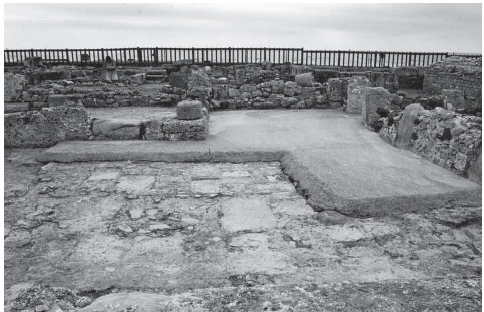
FIGURE 2 The protective contact covering of lime-cement mortar completely isolates the surfaces from contact with the environment.