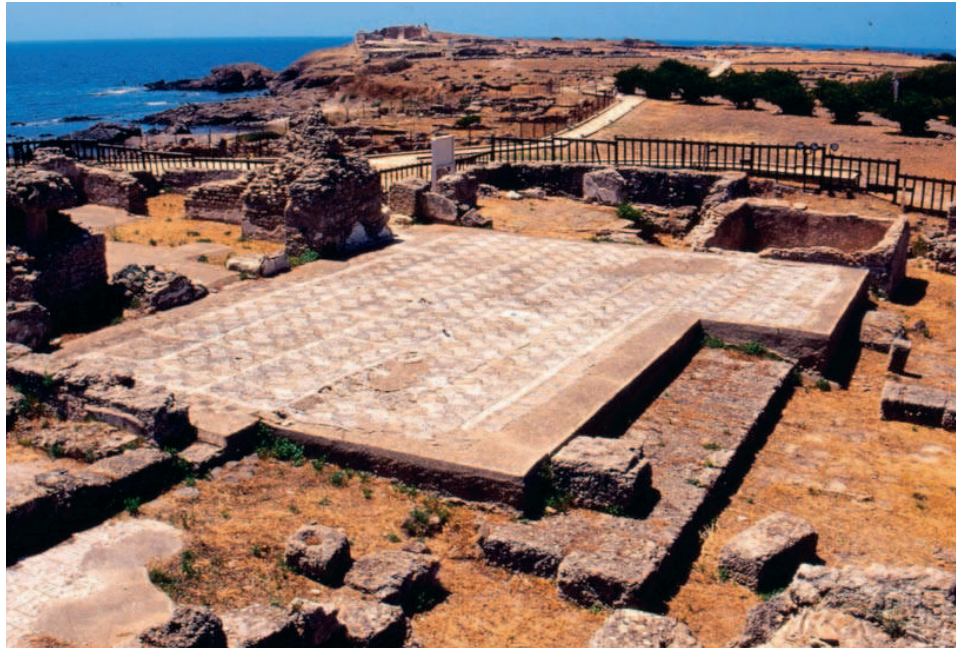
FIGURE 4 Central baths, frigidarium . The pavement is on reinforced concrete with metal rods and suffers from such serious deterioration that the survival of the original material is at great risk.

concrete with metal rods (fig. 4). For some years now mosaic specialists have known the reasons for this situation: oxidation and consequent expansion of the iron, the excessive hardness and low porosity of cement, and solubilization and crystallization of soluble salts—all these factors take their toll on the ancient materials.